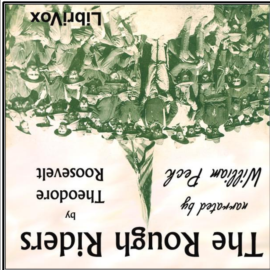
Photo by William Dinwiddie, Spanish-American War correspondent for Harper's Weekly. Cover design for Librivox by Michele Fry

Easy Folding Instructions for this Origami CD case, including step by step photos, can be found here . Can also access from the LV Wiki page, CD Covers.